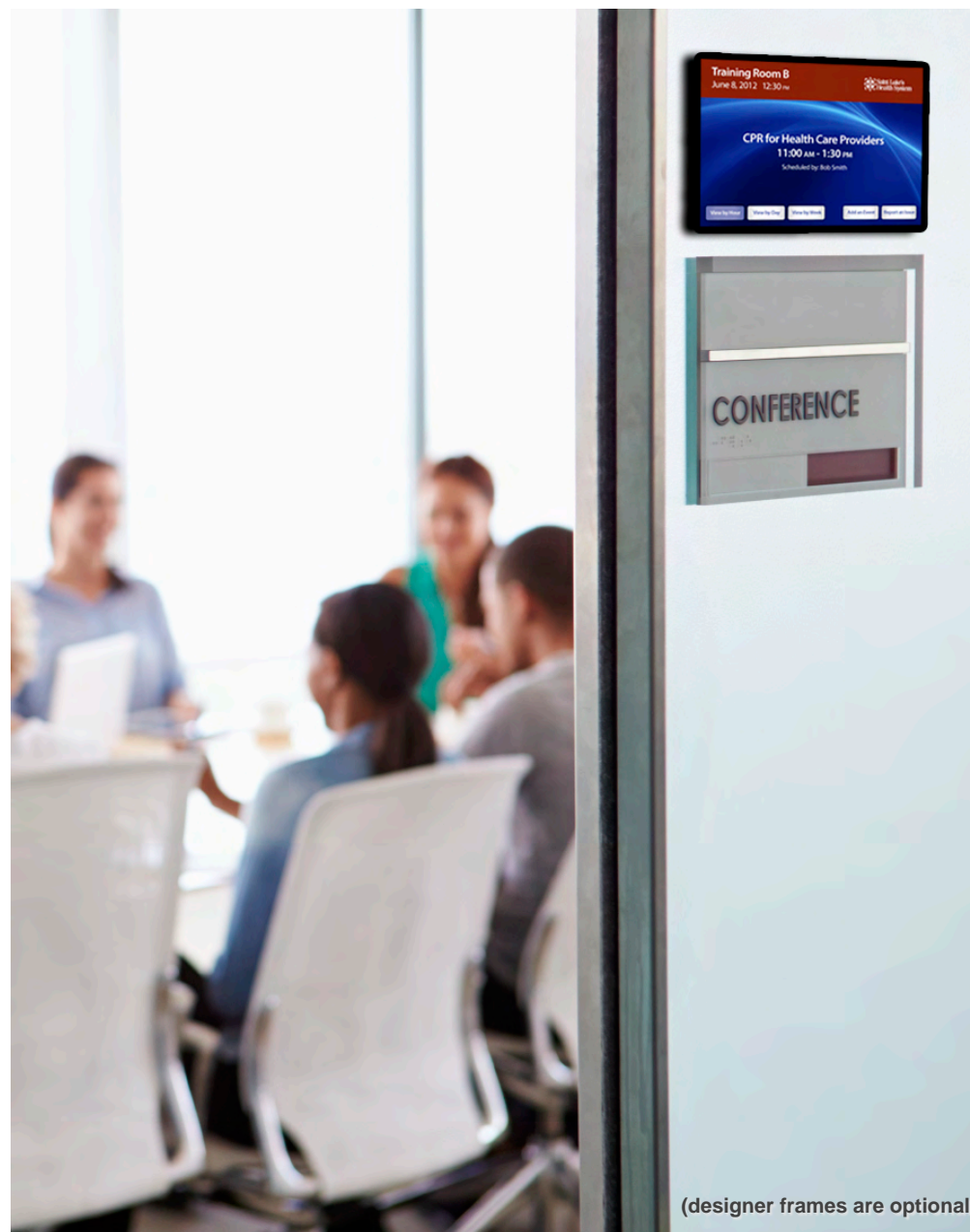
(designer frames are optional)